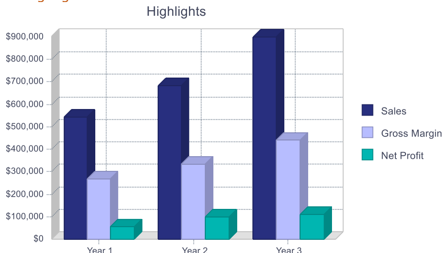
Chart: Financial Highlights