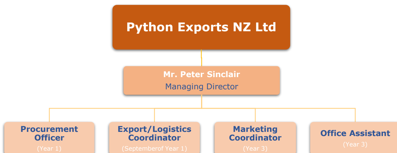
Chart: Organisational Structure